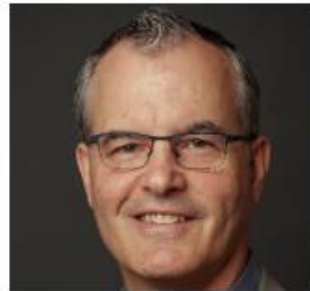
Yorke Rhodes Microsoft