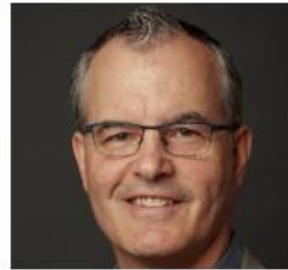
Yorke Rhodes Microsoft